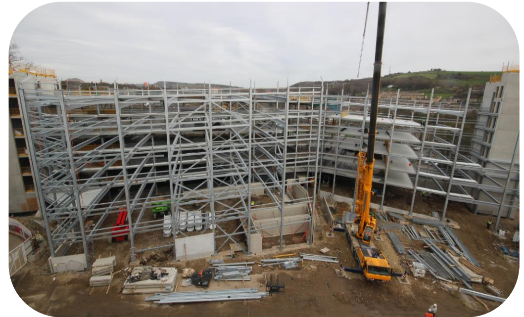
A photo showing the progress on the new Multi-Storey Car Park taken from the time lapse camera on Monday, 23rd March