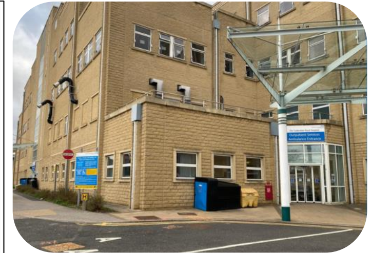
The Outpatient Services / Ambulance Entrance